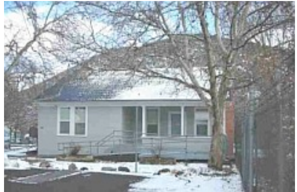
Siskiyou County Genealogical Society